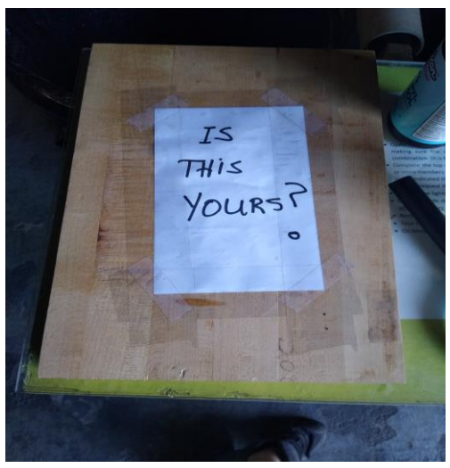
This was left under one of our benches. Anyone ???